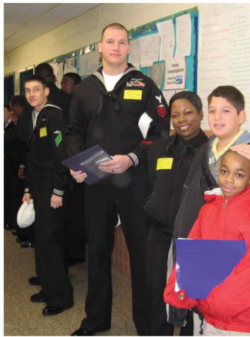
Sailors from the USS Bush with Newsome Park Elementary students.

More than 3,500 volunteers have given nearly 68,000 hours of service to NNPS. More than 300 local businesses and organizations have created partnerships with city schools; and 82 business partners have committed to lend their support and talents to Career Pathways by providing worksite opportunities, job shadowing, club/activity sponsorships, internships and speaking engagements.