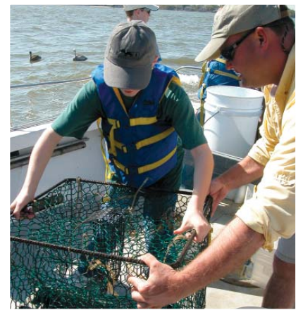
Students in marine science magnet program at B.T. Washington Middle take frequent boat trips.

Magnet programs and other offerings give Newport News families and students many choices for their educational experiences. Online classes are offered through NovaNET at all high schools. Students can receive college credit through Advanced Placement classes and dual-enrollment at Thomas Nelson Community College. This year, nearly 750 students are earning college credit through dual-enrollment programs.